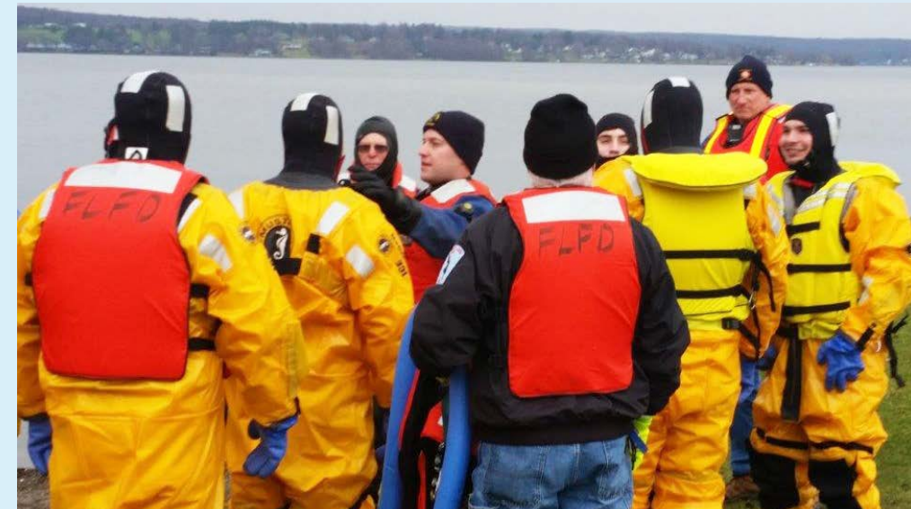
Dive Team Captain Chautauqua County Emergency Services